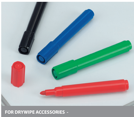
FOR DRYWIPE ACCESSORIES -